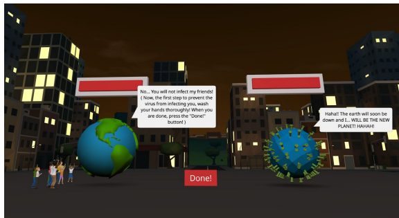
The Earth vs. Covid-19