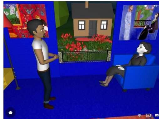
"The Conversation", 1908-1912 by Henri Matisse