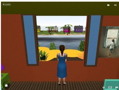
"Woman at the Window", 1925 by Salvador Dali González