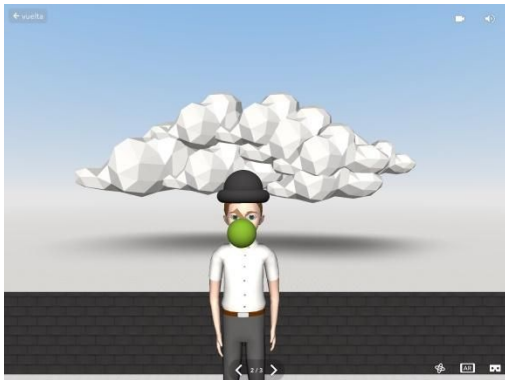
"The Son of Man", 1946 by Rene Magritte