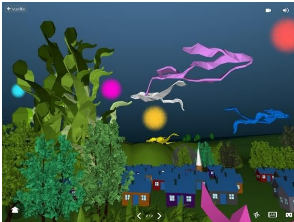
Interactive art. Starry Night